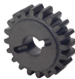
Pinion Z20 for rack